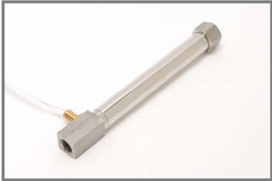
Shown with optional inlet & exhaust fittings